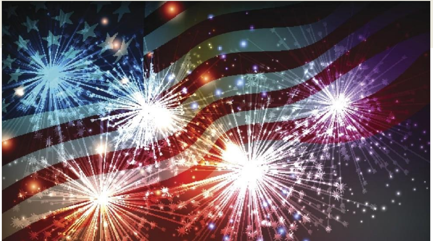
Summer is in full swing as we head into the 2019-20 school year and sports seasons across South Carolina.

Updates provided to member schools by the SCHSL staff on a weekly basis.