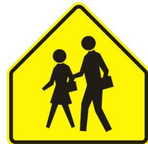
Protecting Students from Abuse