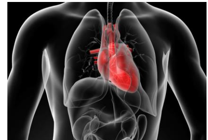
Sudden Cardiac Arrest