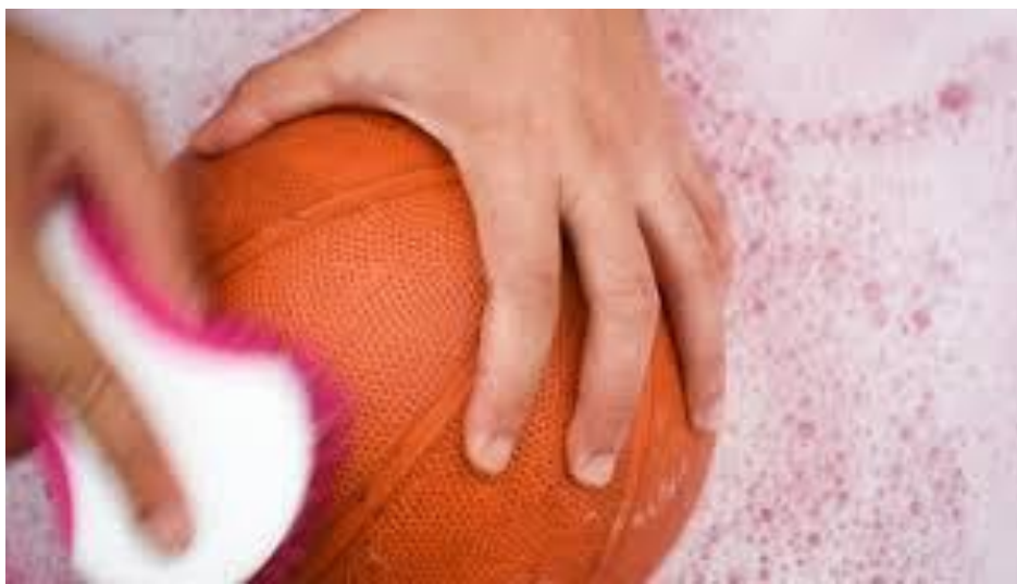
Click image above ↑