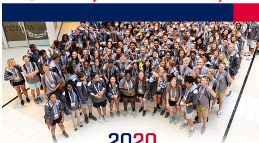
2020 NFHS National Online Student Leadership Summit

Did you miss the 2020 NFHS Student Leadership Summit? Did you want to see a presenter one more time? Click below for On-Demand viewings: